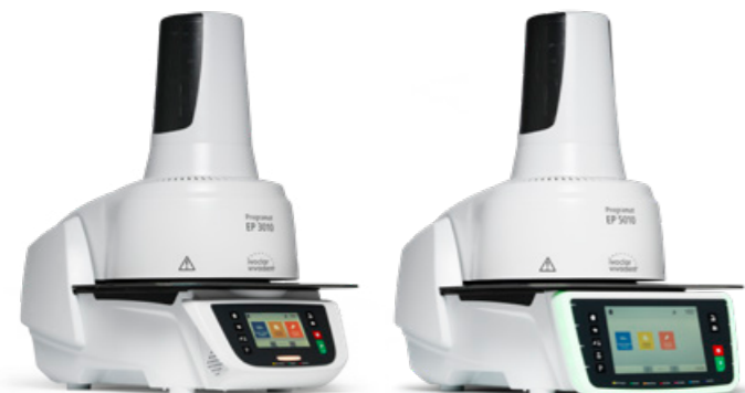
The new Programat press furnaces: EP 5010 G2 and EP 3010 G2

Proven technologies, such as the fully automatic press function (FPF), combined with new features - that is what makes the new Programat press furnace your reliable partner.